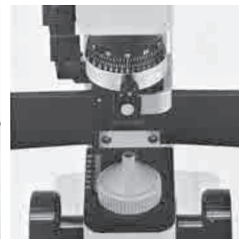
Measurement of Contact Lens

Design and specifications are subject to change without notice.