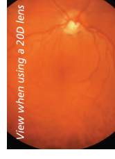
View when using a 20D lens