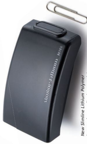
New Slimline Lithium Polymer battery (paper clip shows scale)

Our new Slimline Lithium Polymer battery weighs only 53 grams and is as light and as small as the new mini iPod.