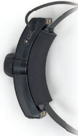
Slimline Lithium Polymer Battery