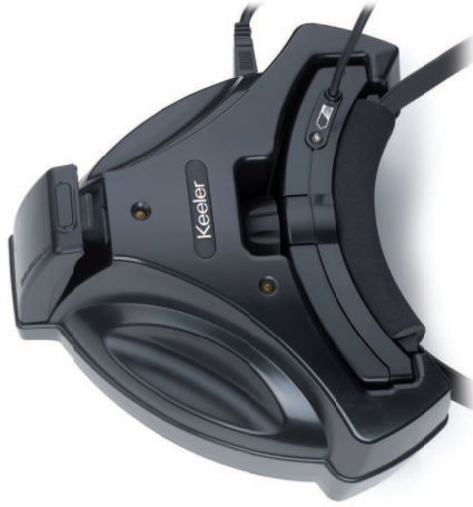
Slimline Wireless Charger

The new wall mountable charger remains as durable as the Standard Wireless battery charger with the facility to store your extra battery in the top compartment. The charger has an easy release button to remove your extra battery.