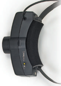
Standard Lithium Battery

The Standard Wireless Charger can be wall or desk mounted with space for a spare battery, which means you will always have a back up. An LED indicates when the battery needs charging.