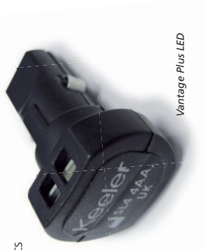
Vantage Plus LED

Clinically, the superior optics combined with the natural LED illumination could provide greater detail, allowing you to find retinal pathology that was not visible with the Xenon bulb.