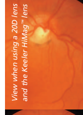
View when using a 20D lens and the Keeler HiMag™ lens