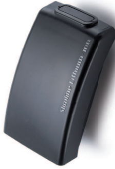
Slimline Lithium Polymer Battery

Keeler wireless technology allows you to move from room to room without any constraints. The chargers are either desktop or wall mountable and store an extra lithium battery as a back up, should you need it.