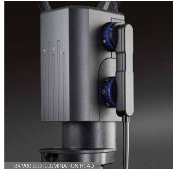
BX 900 LED ILLUMINATION HEAD

The high power flash illumination is delivered via a xenon tube that lies co-axial to the LED illumination and thus reproduces exactly the slit illumination pattern to provide images of stunning quality. The brightness of the flash is individually adjustable for slit and background illumination.